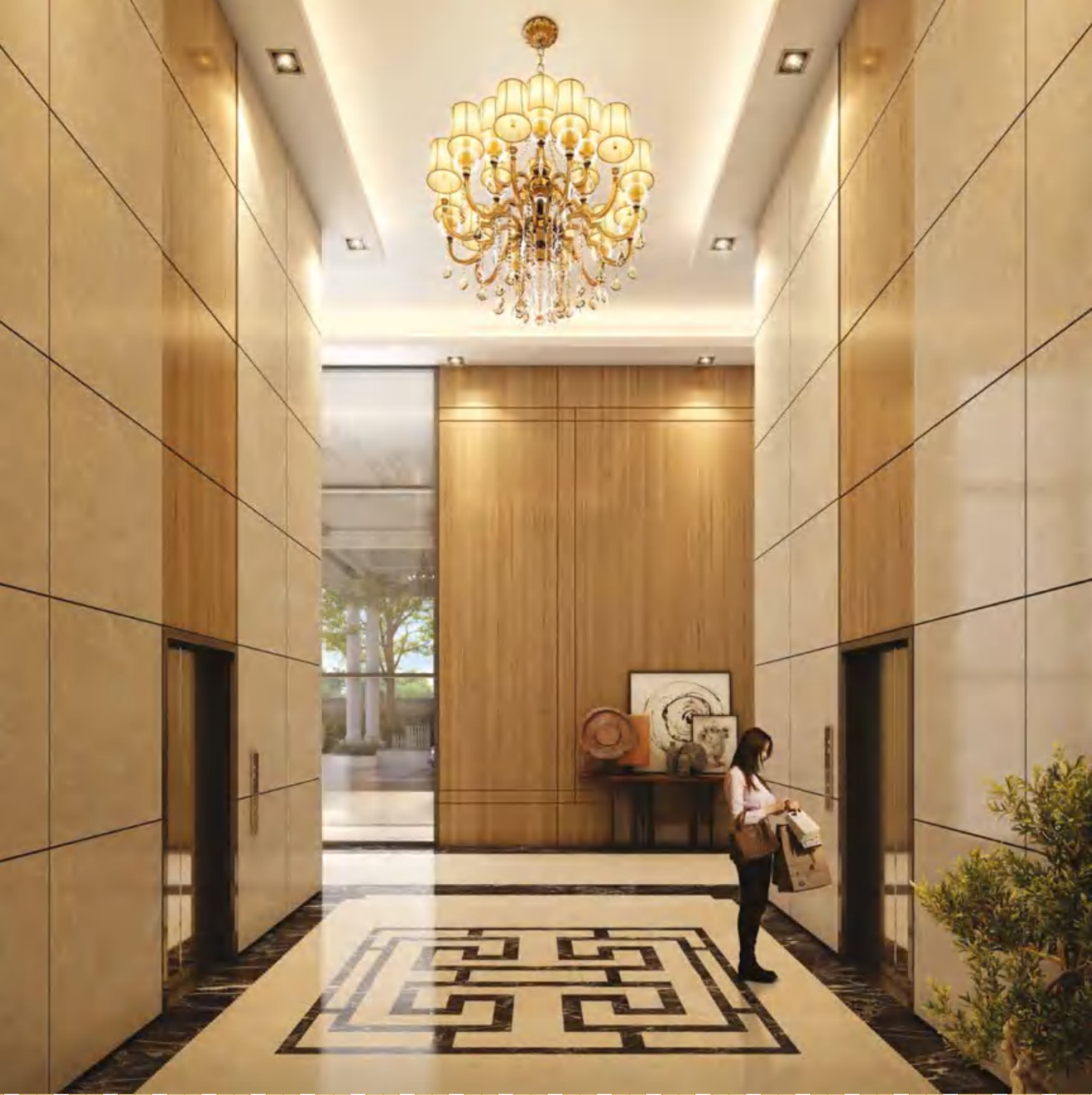
Lofty Lift Lobby