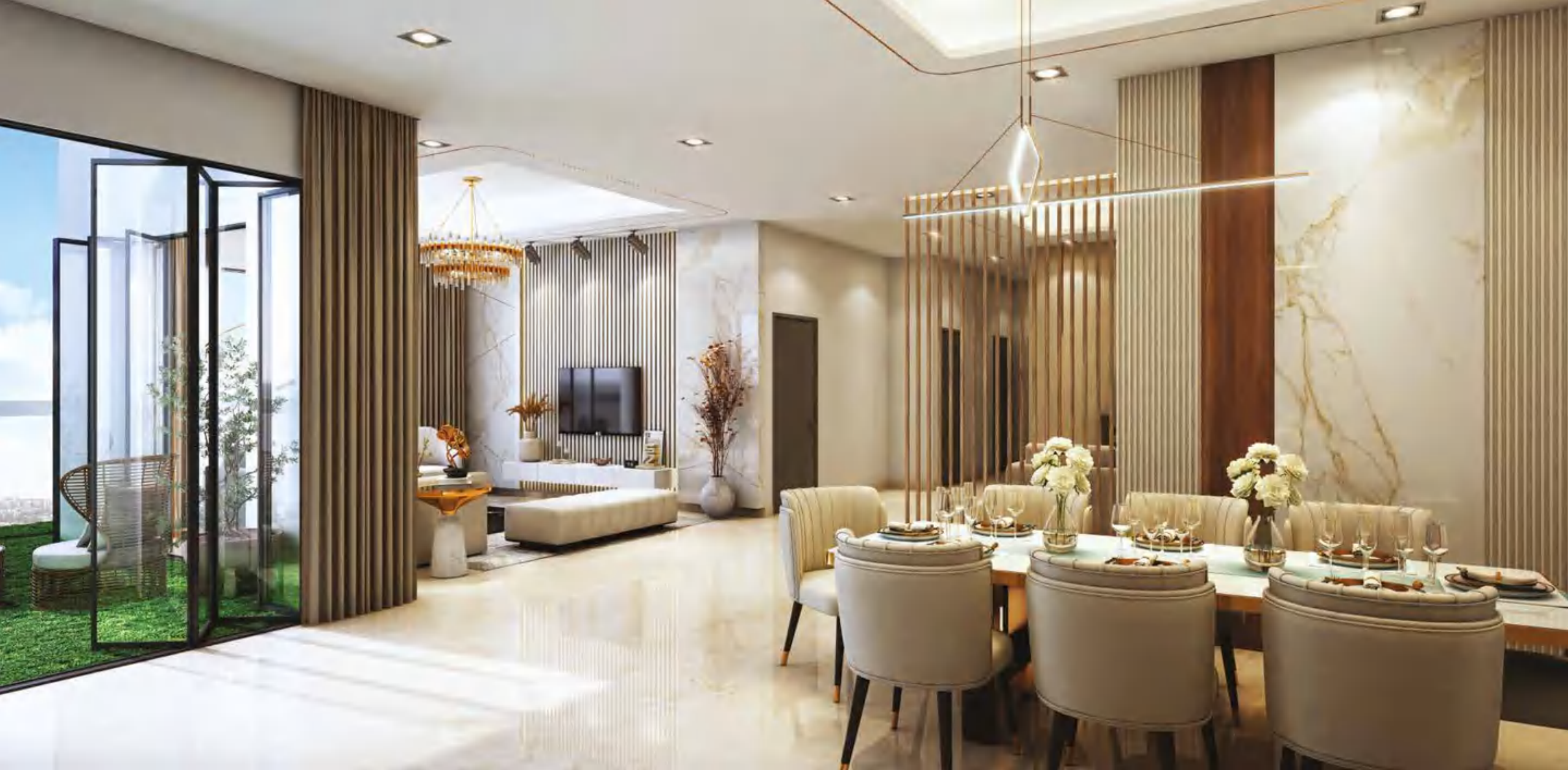
Living & Dining Room