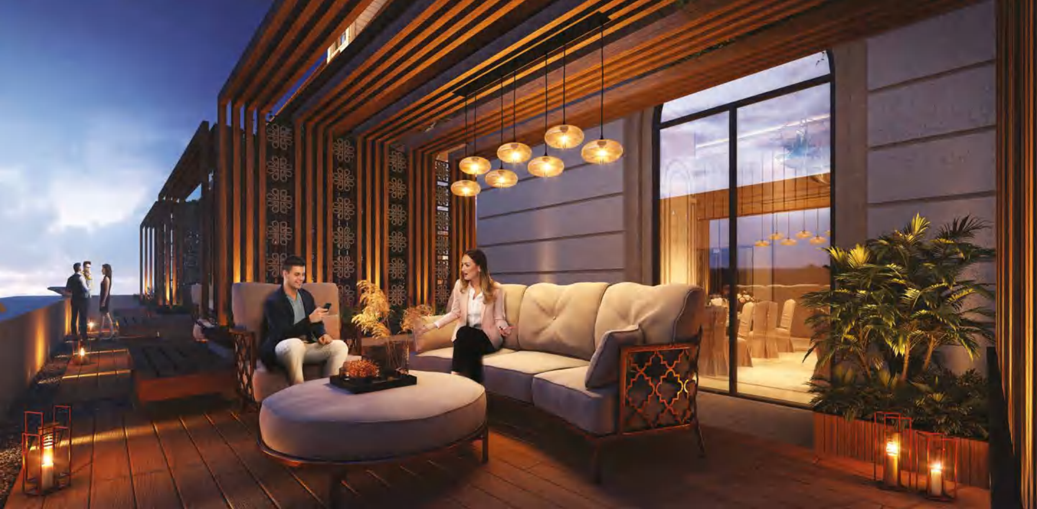
East View Terrace