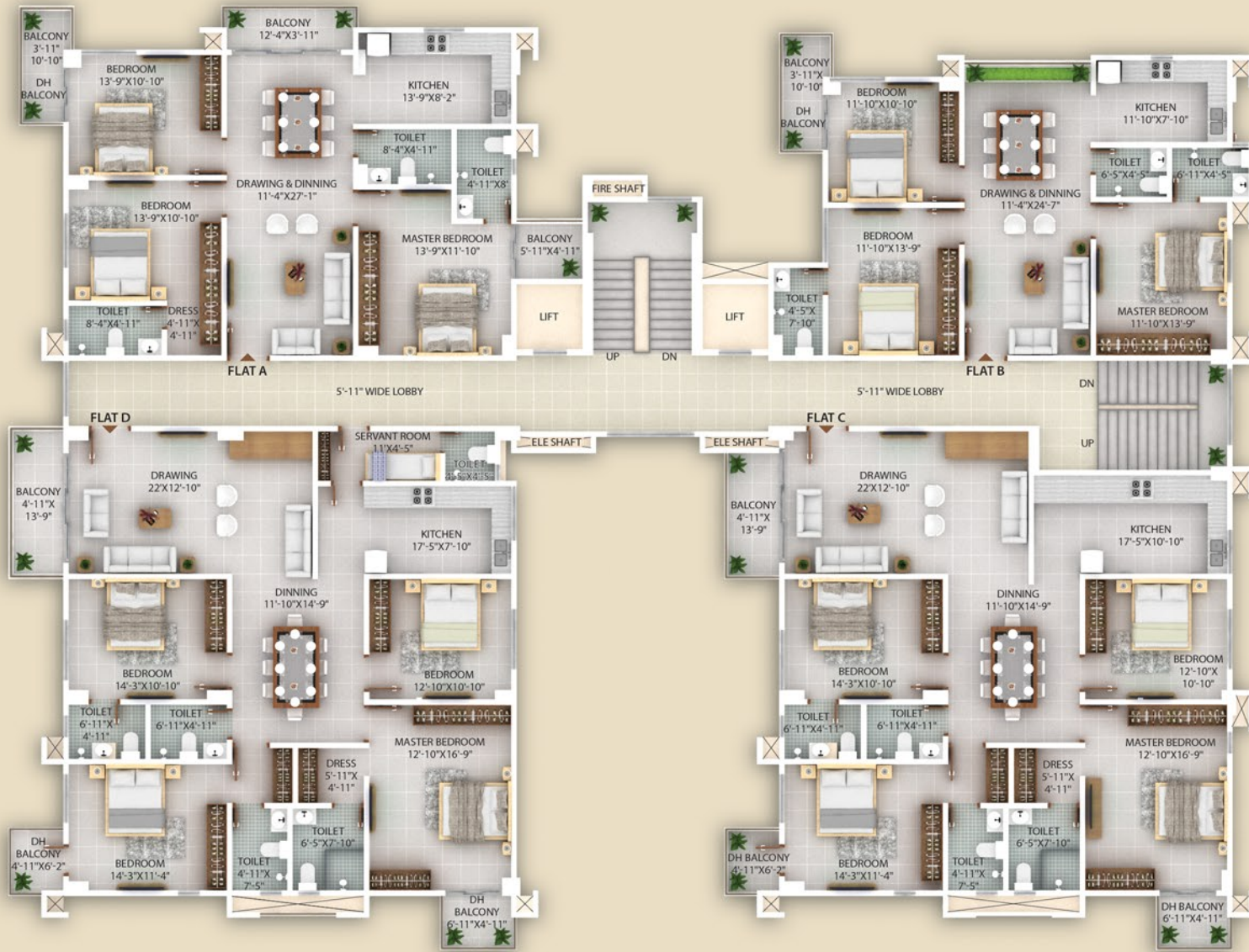
2ND TO 7TH FLOOR PLAN