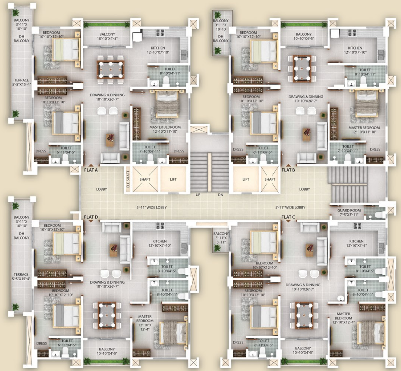
7TH FLOOR PLAN