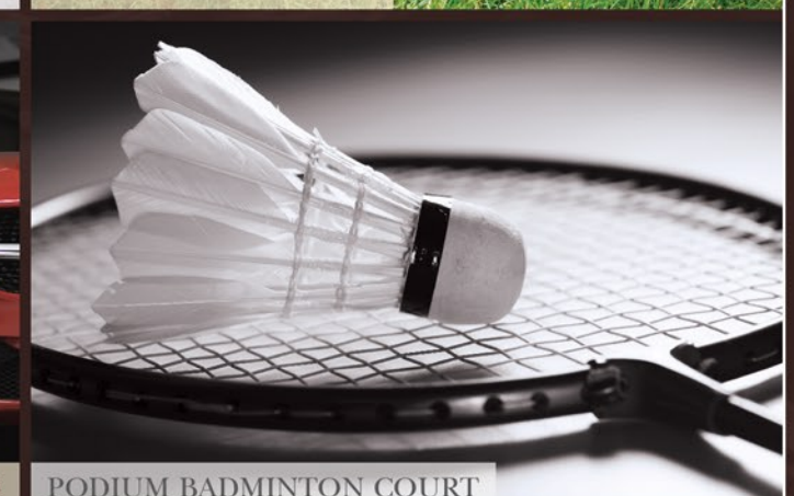
PODIUM BADMINTON COURT