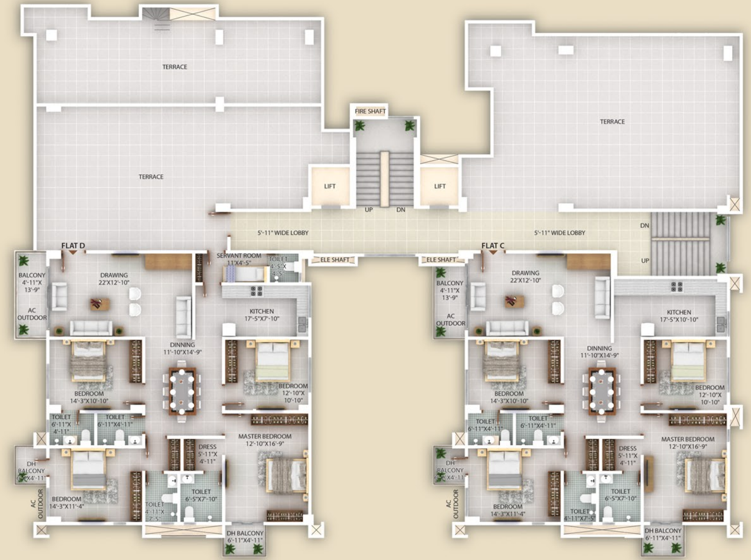
8TH FLOOR PLAN