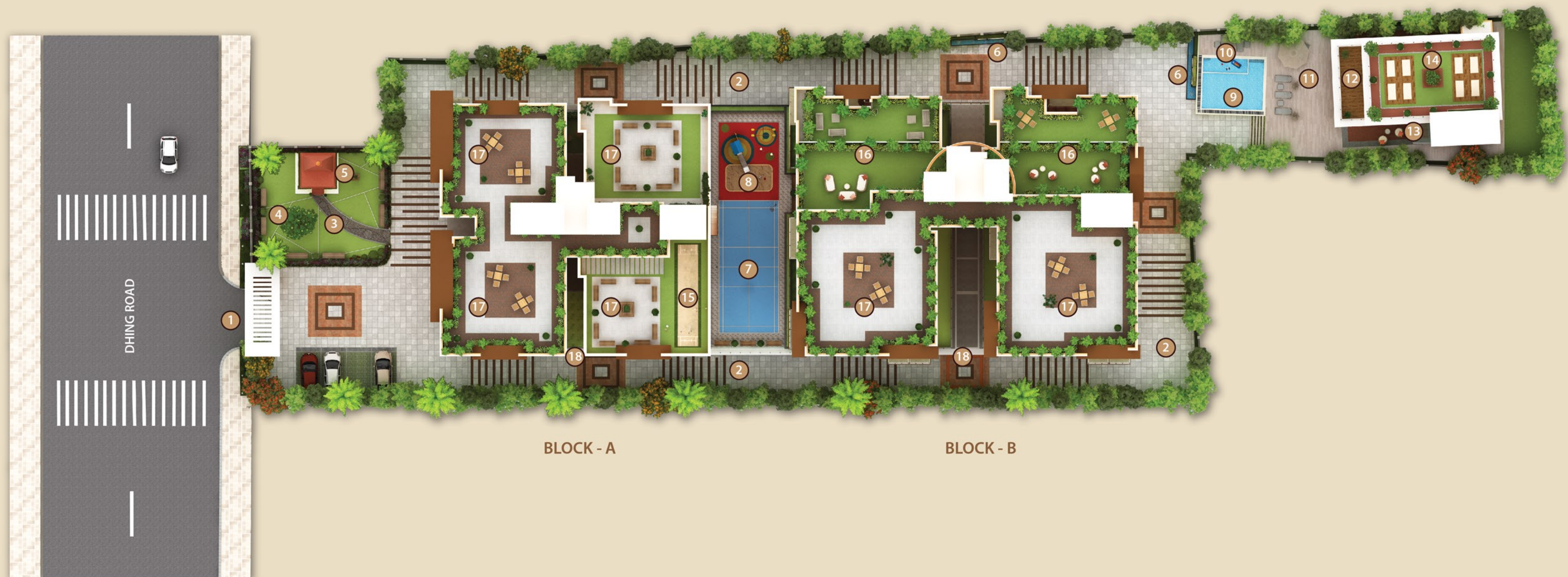
BLOCK - A