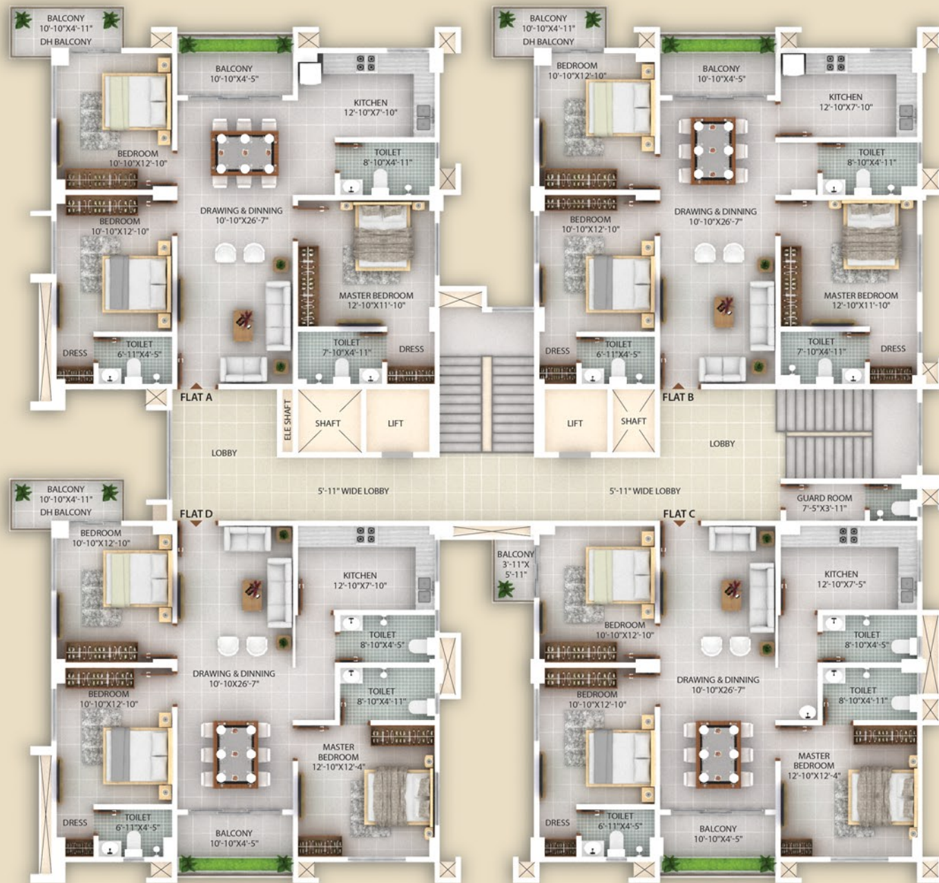
2ND TO 6TH & 8TH FLOOR PLAN