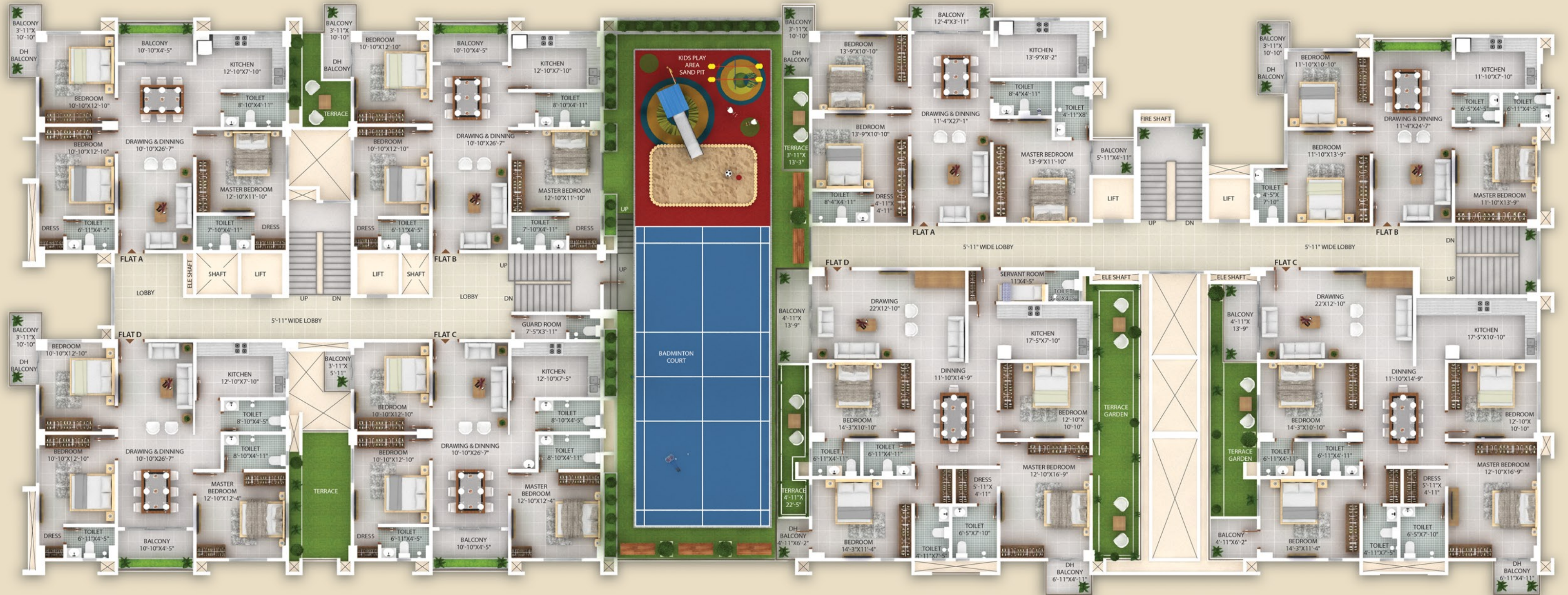
BLOCK - A